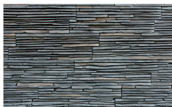
408 Monte Negro